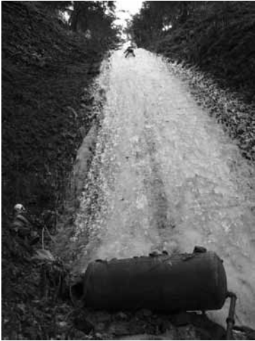
Bill Price leading Waterheater